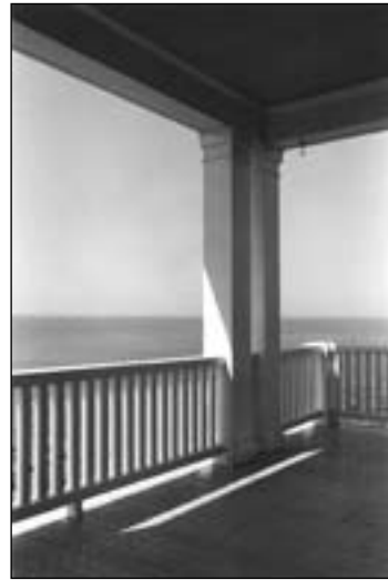
Porch, Monhegan Island, ME, 1971 George Tice

Photographers are invited to submit photographs to be considered for exhibition at the 17th Annual Juried Photography Exhibit of the New Jersey Photography Forum. The exhibit is open to any photographer able to hand deliver their work to the Watchung Arts Center on the Watchung Circle in Watchung, NJ on Saturday, October 29th, between 1 and 4 p.m. The cost is $20 for every two photographs entered. There is no limit to the number of entries. The public is invited to attend the opening reception on Sunday, November 6th, from 1 to 4 p.m., at which time awards will be presented and everyone will have an opportunity to meet the artists.