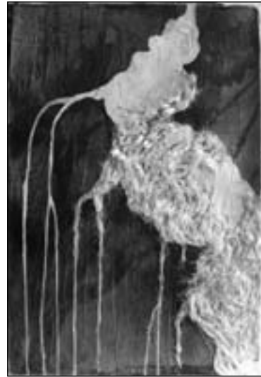
In the Darkness 6

In the Darkness is a body of works including drawings and sculptures in which Yeon Ji investigates the transitory and eerie world of decay and a transformation of organic matter of which the artist has manifest as nurse logs that are each unique microcosms. Each of these mixed media compositions are almost-on-the-verge identifiable, readable forms which are both grotesque and magnifies the beauty of a natural world. Visit www.yeonjiyoo.com for more information.